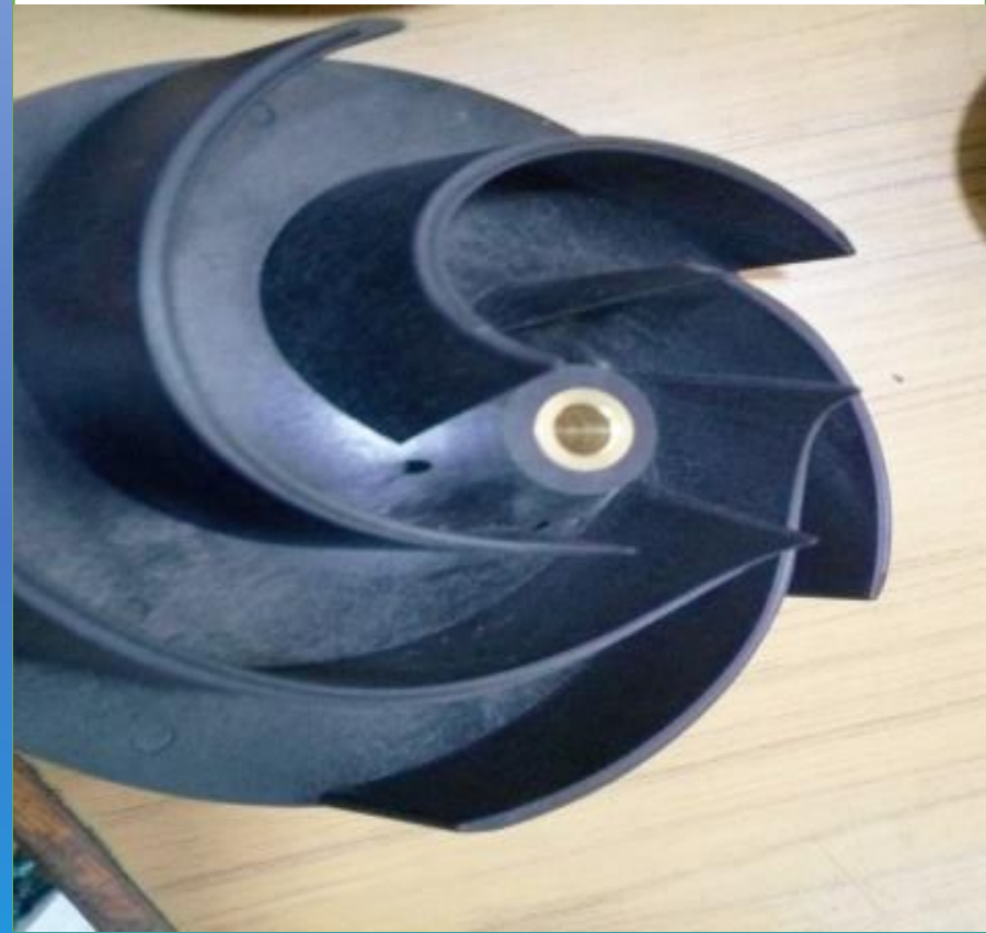
HIGHLY COMPLEX IMPELLER