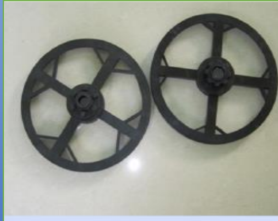
V M WHEEL