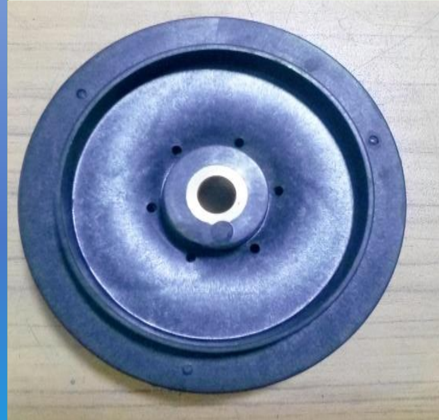
WELDED IMPELLER WITH BRASS INSET