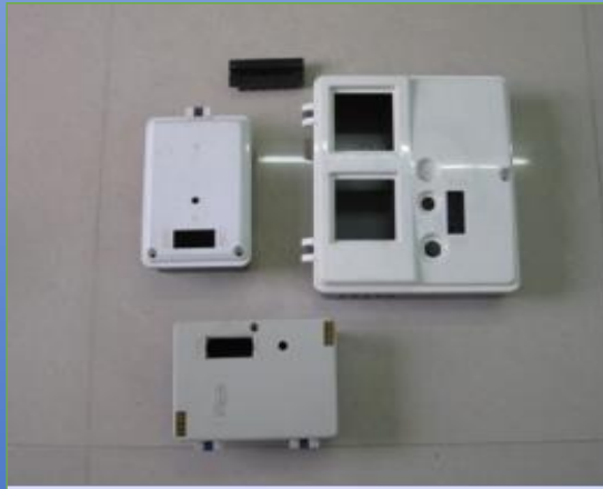
COOLING COVER RED