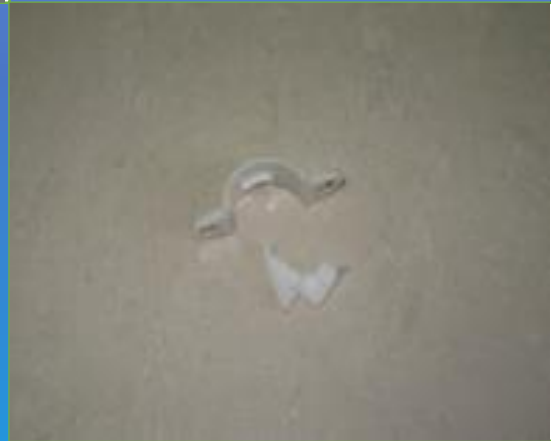
AGRI CLIP AND CAP